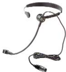
MC-72X Speech headset MIC