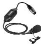
MC-16X Lavalier microphone with volume control