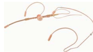
TM-635D Earhook skin colour MIC uni directional