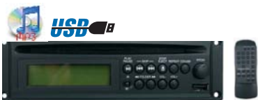
CD-456 CD/USB player + Pitch control