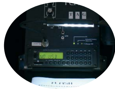
Flash/L1 Lamp Littlite with LED