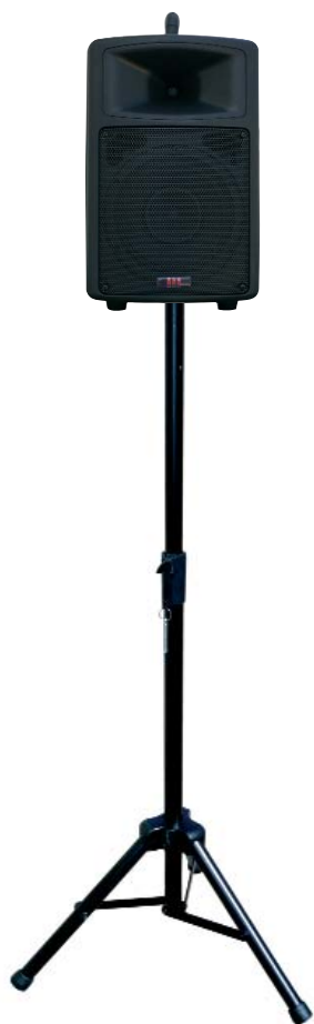
Example of one Premio with its tripod stand PIED-SS18.

With its wireless transmitter module RP-6016M Flash can be connected to several additional cabinets and integrated with a full TAG audio system. It makes it possible to multiply the acoustic power.