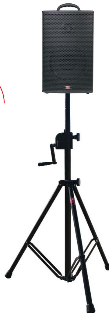
Example of one Nomade with its tri- pod stand PIED-SPS4