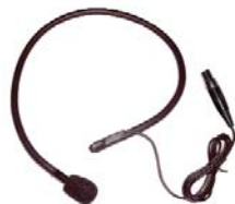
MC-75X Collar MIC