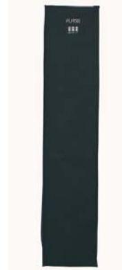
Flash/H Bag for Flash