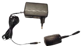
HC-30 Handheld Micro charger SQ5016