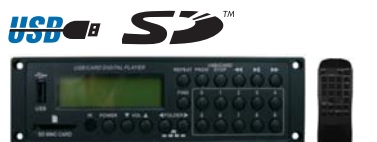
EM010PR MP3/USB/SDMMC player + Pitch control