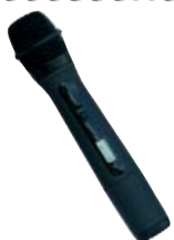
SQ-5016 Handheld MIC/Transmitter