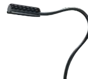
Lamp Littlite with LED