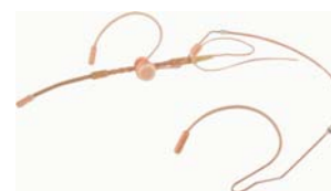
TM-635D Earhook skin colour MIC uni directional