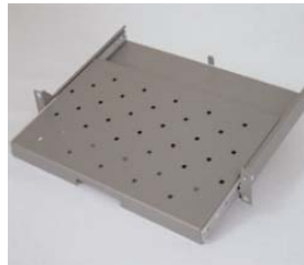
Telescopic shelf 1U