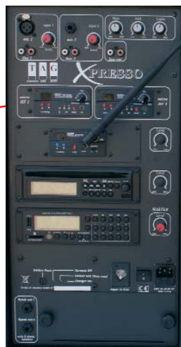
Example Full Options