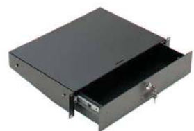
Steel rack drawer 2U