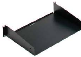
Steel rack shelf 2U