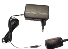
HC-30: Charger for SQ-5016