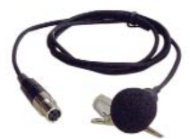
MC-15X Lavalier microphone

For further details please see Options and Accessories of Xpresso.