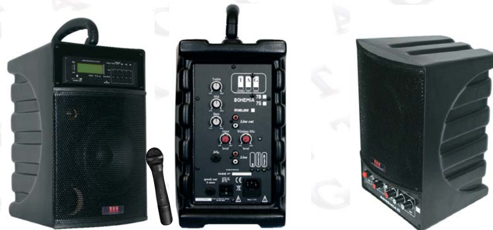
Example of a Bohemia 7B with a built-in VHF receiver module, CD/MP3/USB player and Microphone.